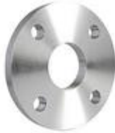
( Flat Flange )

We supply all types of flanges as follows: