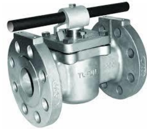
( Plug Valve)