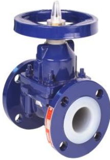
( Diaphragm Valve)