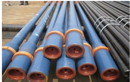
Heavy Weight Drill Pipe With Different Diameter