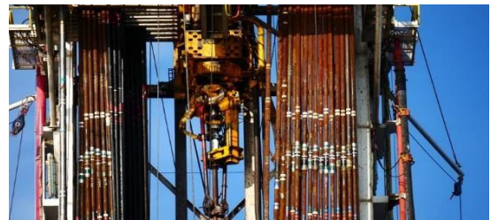
Drilling Pipe In Derrick