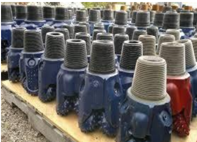
Rock Bit tri-cone

♦ Rock Bits: Tooth insert Bits: these bits sizes usually are available from 8\frac{1}{2} to 30 inch.