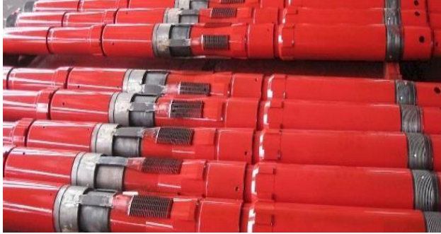
Liner Hanger Packer