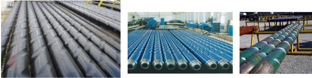
Drill Collars with Different Diameters

A drill collar is a large-diameter, heavy pipe used in oil drilling that fits around the drill string and puts weight on the drill bit and it's is the most widely used equipment after drilling pipes which have a very important role in well drilling, Because of high weight, It increases weight and drilling speed. These are available is sizes of: 3\frac{1}{2} , 8\frac{1}{2} , 9,11,13 inch and should be available on the rig.