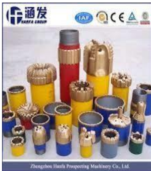
A set of PDC Bits

TSP: Thermally stable Polly crystalline.