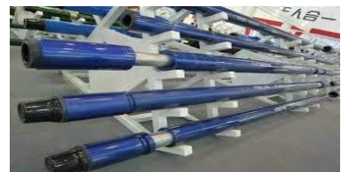
Hydraulic Jar Pipe