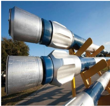
Downhole Motor PDM

The positive displacement motor (PDM) has been used in directional drilling now for several years and is a key component in bottom hole drilling assemblies. These downhole drilling motors, coupled with Measurements While Drilling (MWD) tools and proper stabilization allow directional wells to be drilled with one bottom hole assembly, eliminating costly multiple drill string tripping, which in the past was necessary for surveying, hole corrections, and stabilized assemblies.