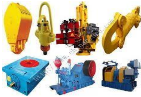
Some of Drilling Rigs Components